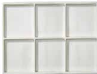
405x305x85mm Deep tray with 6 compartments