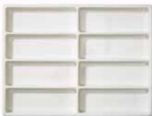
405x305x22mm Shallow tray with 8 compartments