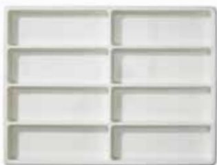
405x305x22mm Shallow tray with 8 compartments