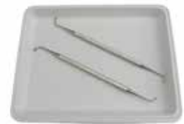
14x18cm disposable tray - flat