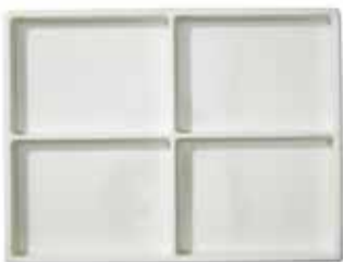
405x305x85mm Deep tray with 4 compartments