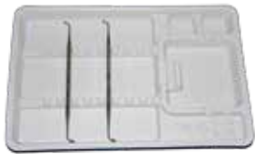
18x28cm disposable tray with preformed instrument holder