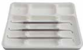
14x18cm disposable tray with preformed instrument holder