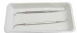
10x20cm disposable tray - flat