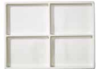
405x305x22mm Shallow tray with 4 compartments