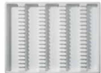
405x305x22mm Shallow hand instrument rack