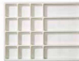
405x305x22mm Shallow tray with 12 compartments