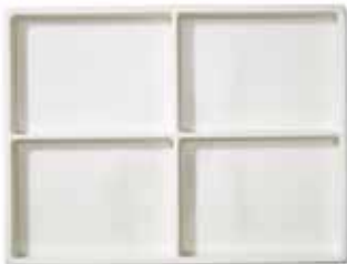
405x305x85mm Deep tray with 4 compartments