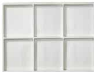
405x305x85mm Deep tray with 6 compartments