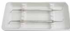
10x20cm disposable tray with preformed instrument holder